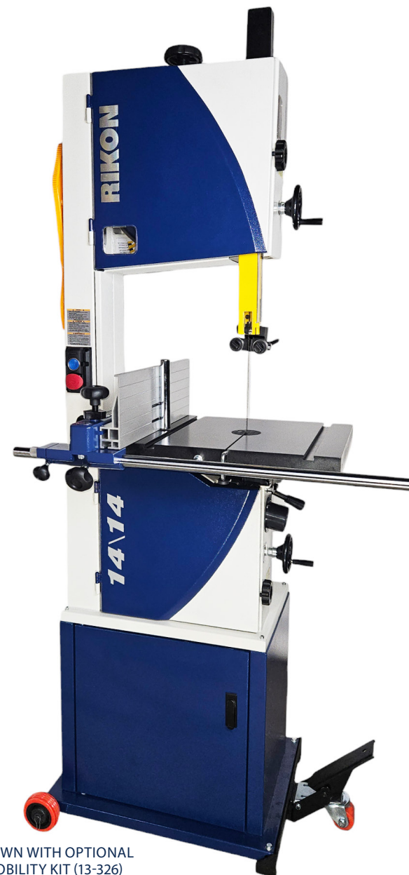
SHOWN WITH OPTIONAL MOBILITY KIT (13-326)