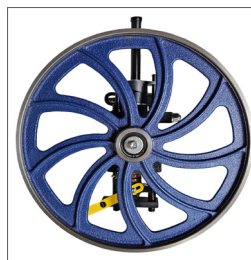
BALANCED CAST IRON WHEELS WITH NEW BLADE TENSION DESIGN