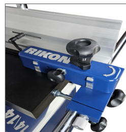
NEW QUICK ADJUST 6" TALL RIP FENCE SYSTEM WITH MICRO-ADJUSTMENT